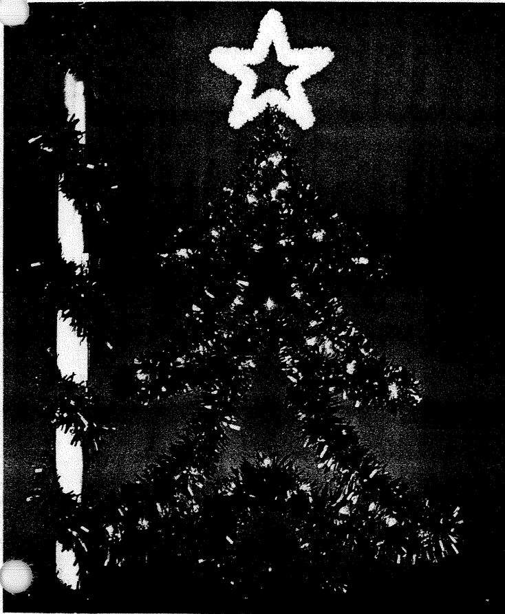
P-119A 8' Fantasy Tree