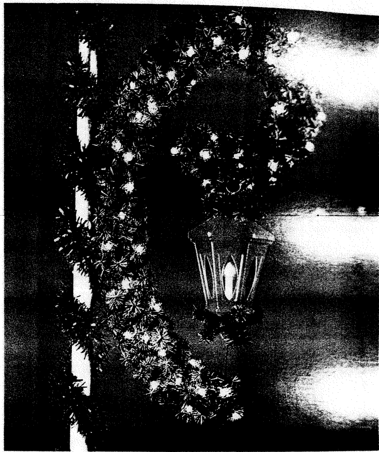
P-146 8' Christmas Scroll with Plastic Lantern