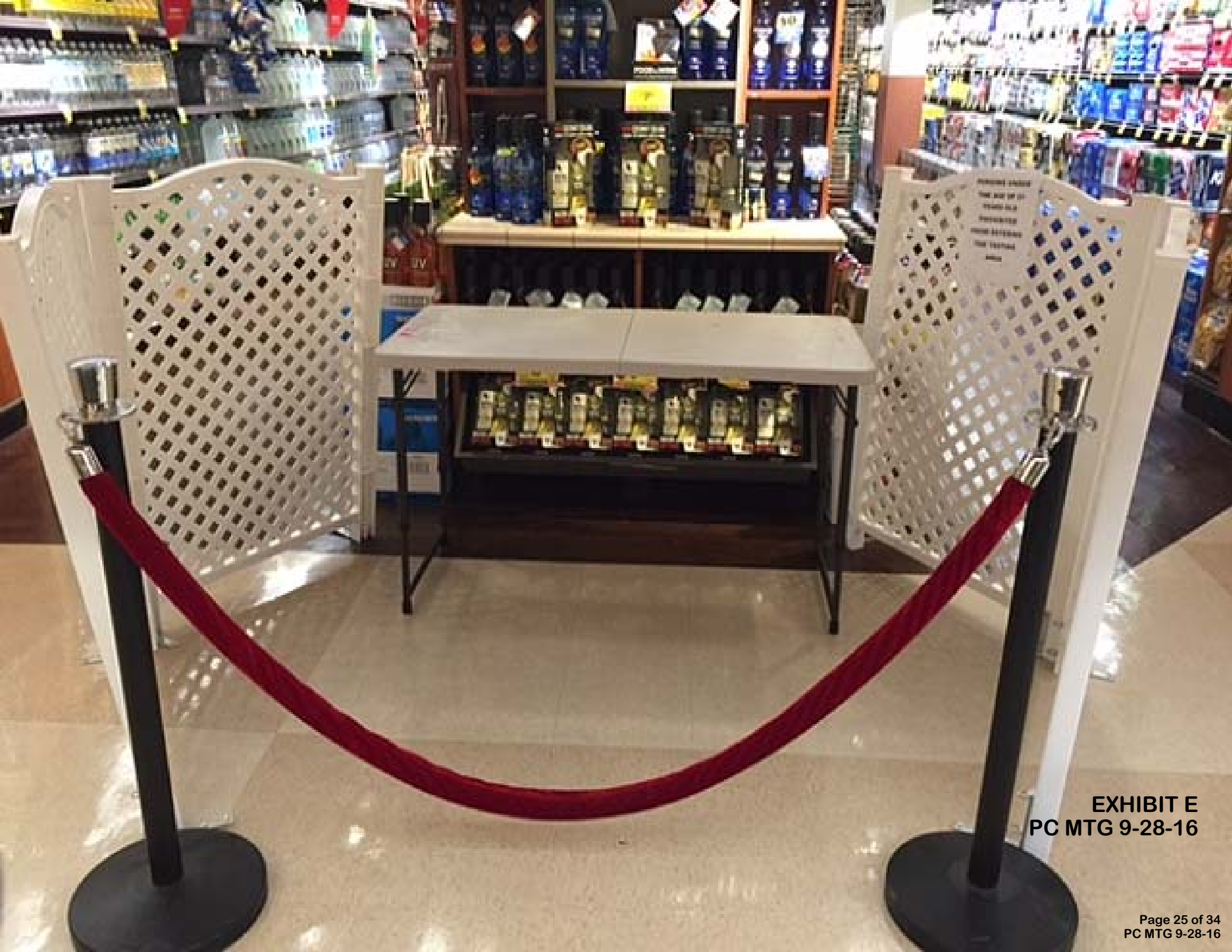
EXHIBIT E PC MTG 9-28-16