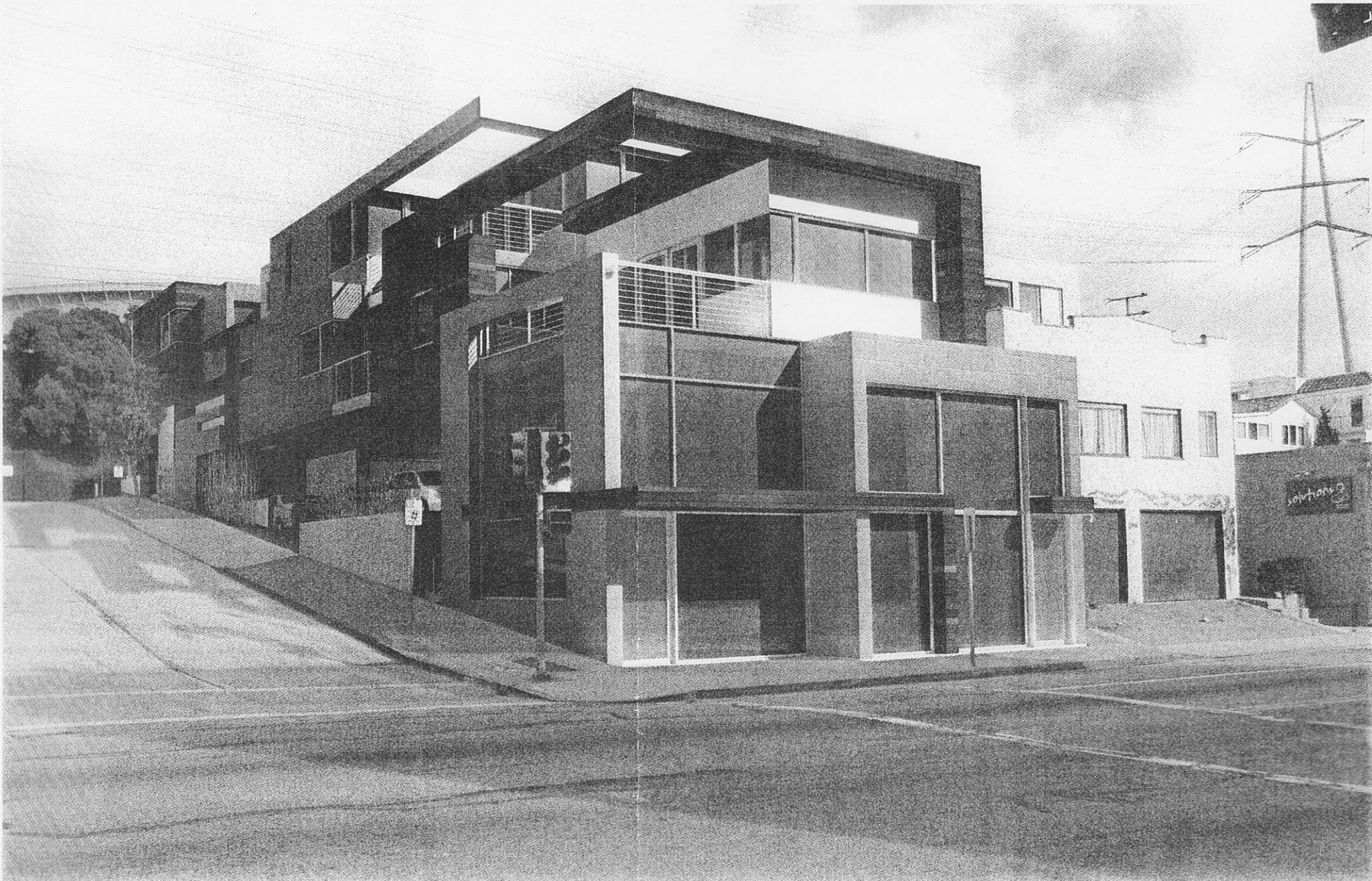
EXHIBIT C PC MTG 4-27-11