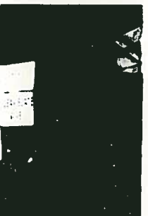
Penny Bordokas Emco