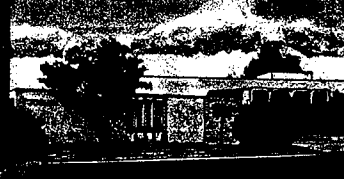
JOSLYN COMMUNITY CENTER