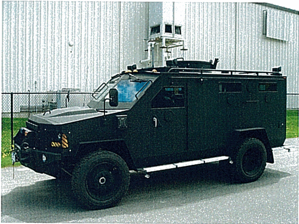
South Bay Platoon Cities' Armored Response and Rescue Vehicle