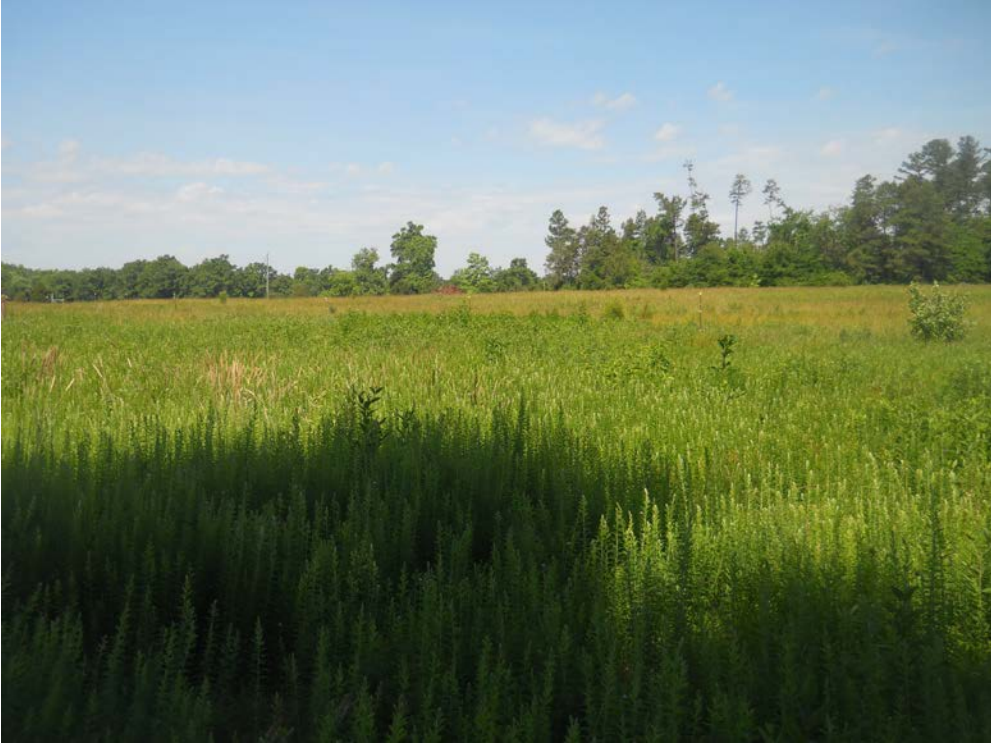
From the east (back) property line