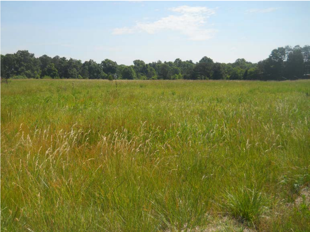
From the west (road side) property line