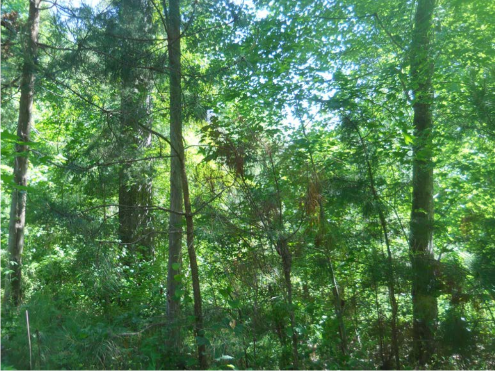
From the south property line