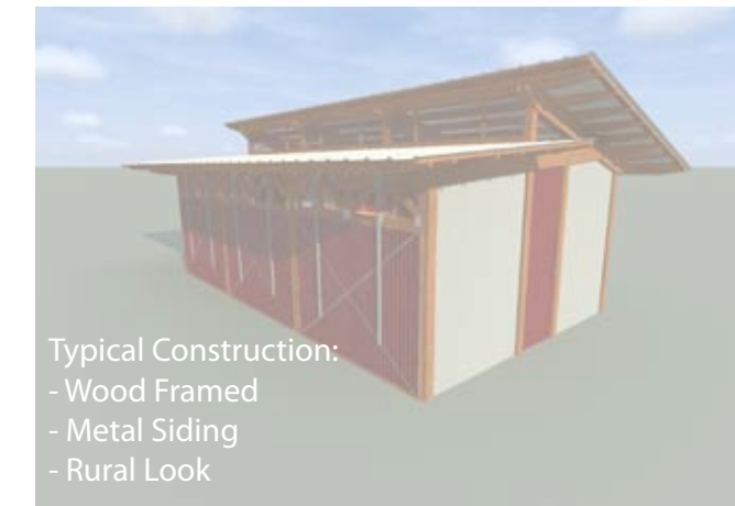
Typical Construction: - Wood Framed - Metal Siding - Rural Look