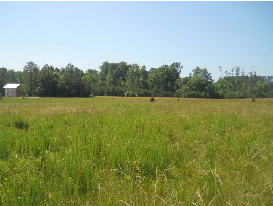
From the north property line