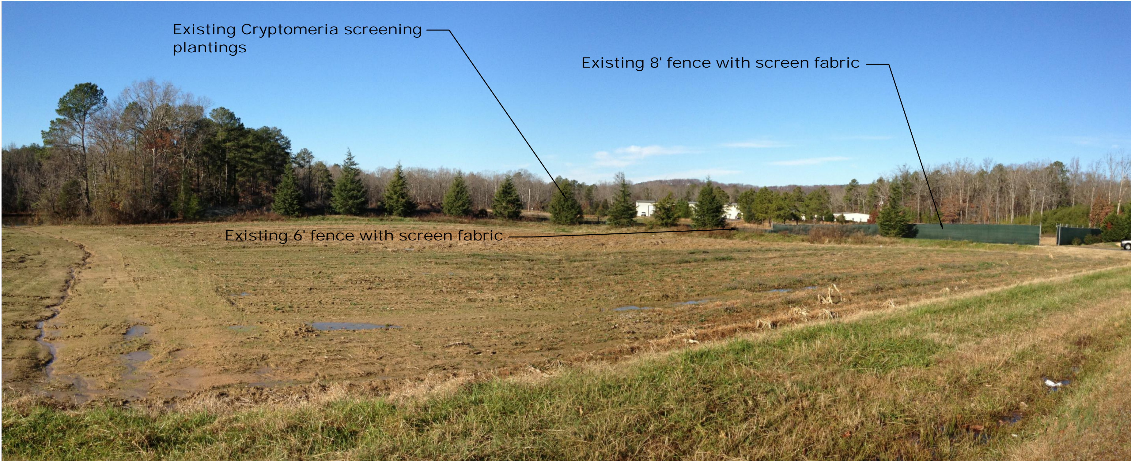
View of East propoerty line from Farrington Point Rd.