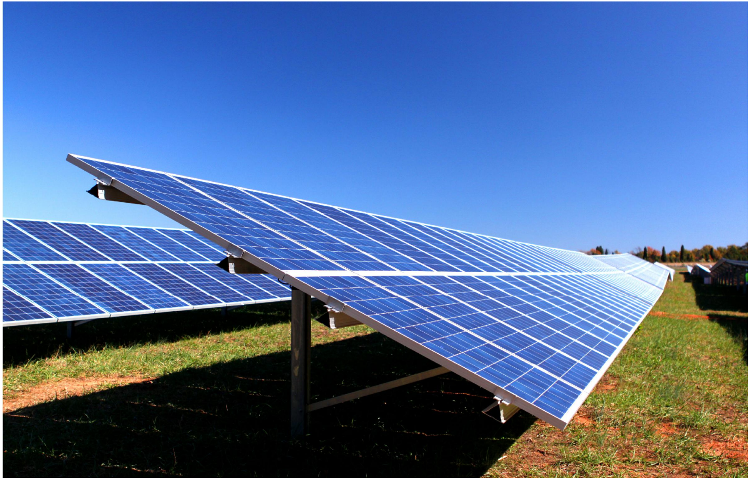
Proposed post & rack mount PVA solar panels