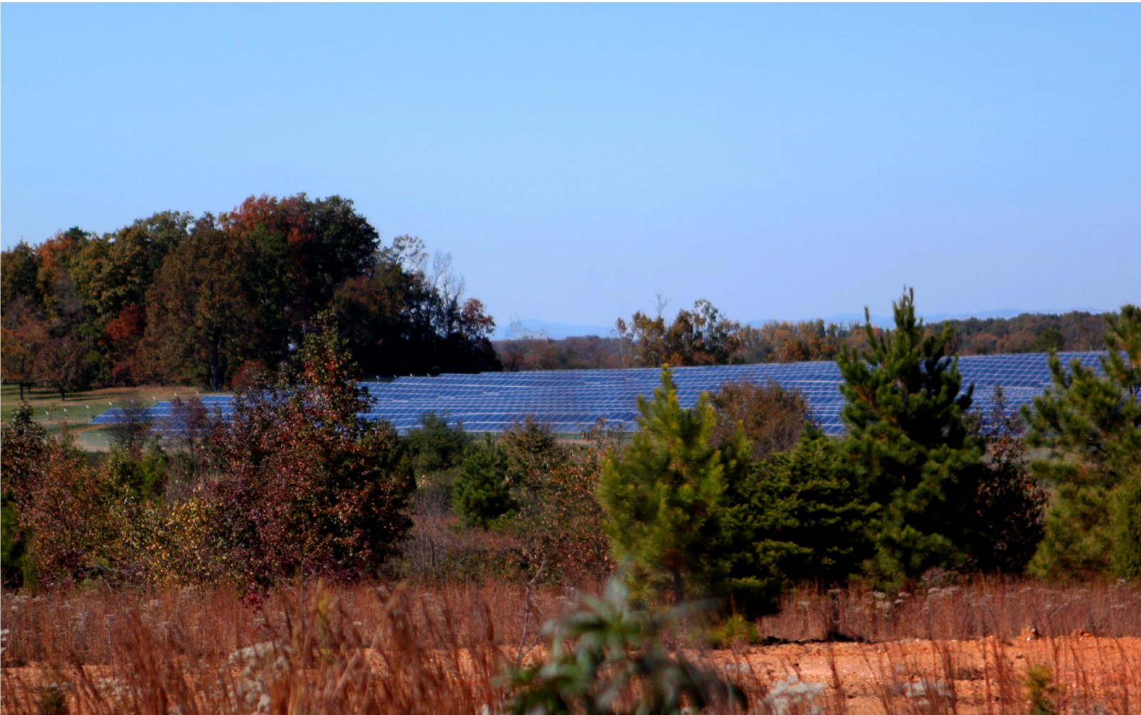
Distant view of similar array installation