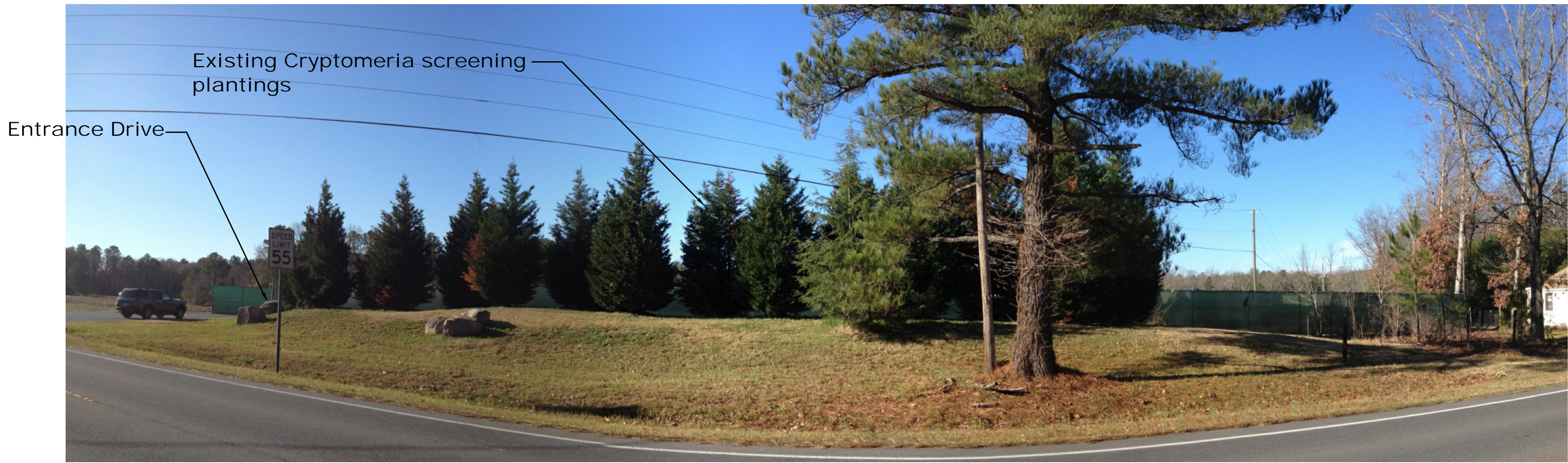
View of frontage on Farrington Point Road