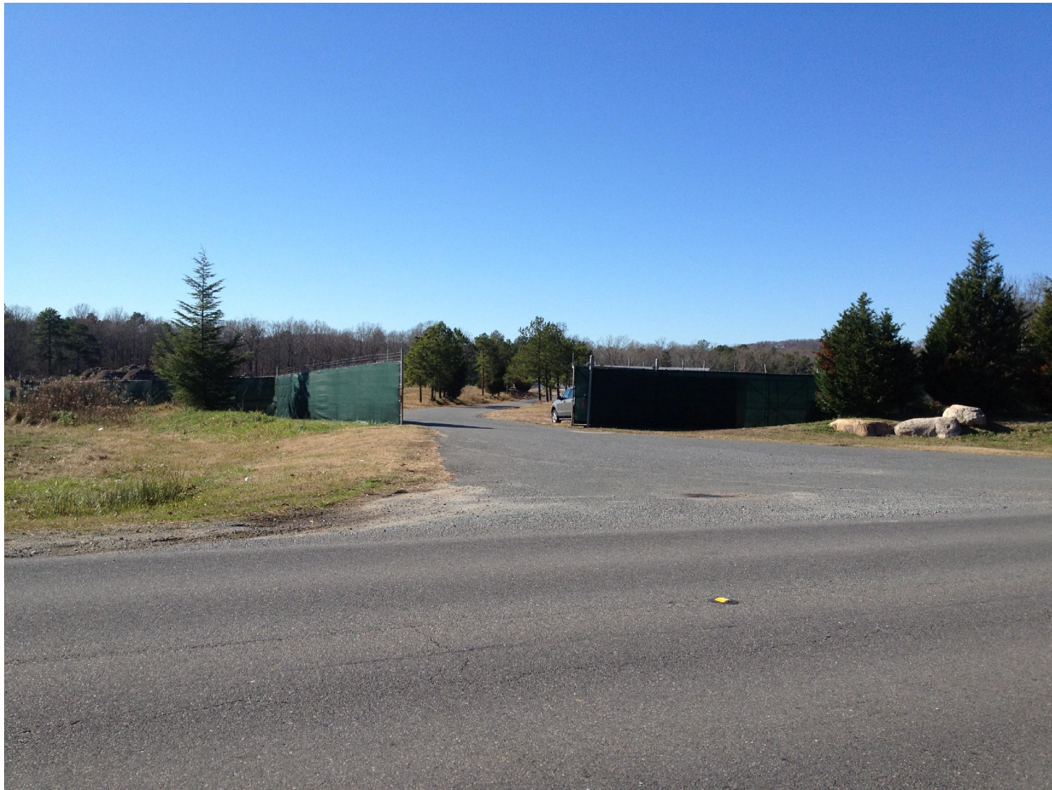
View of entry drive