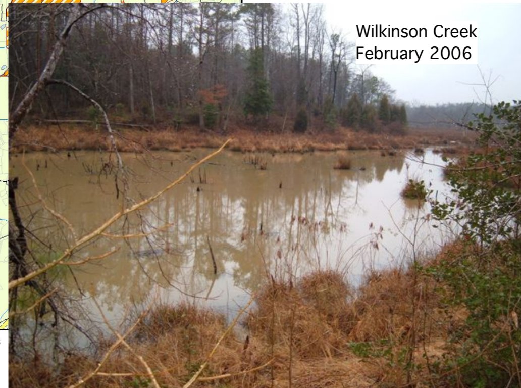
Wilkinson Creek February 2006